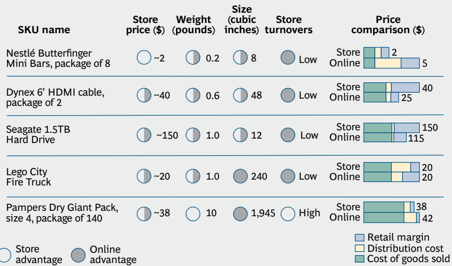
EXHIBIT 2 | Competitive Economics: Online Marketplaces Versus Stores

Note: Assumes one item.